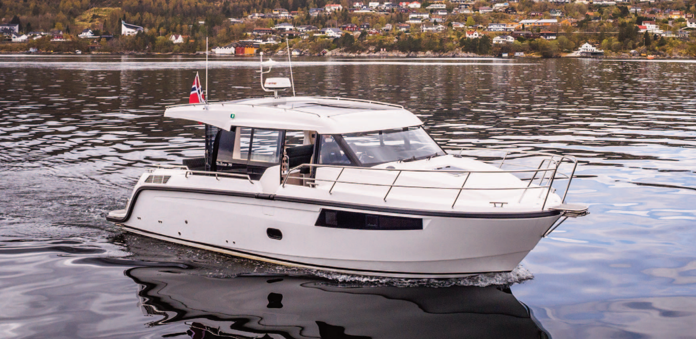
Skilsø 35 Panorama is a bright and spacious family boat. Large salon with lots of natural light. Two beautiful cabins with 5 permanent beds. Toilet room with shower cubicle.